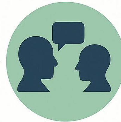
ONE TO ONE SUPPORT