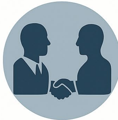
LOCAL WORK PLACEMENT