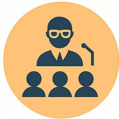
COLLEGE BASED TRAINING